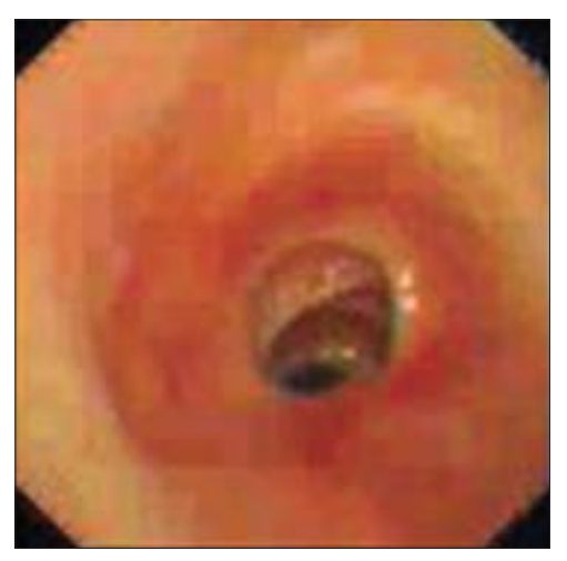
Figure 1: Bronchoscopic image showing multiple web like stenosis

During spirometry, flow-volume loops exhibit a characteristic reduction in peak expiratory flow, with a